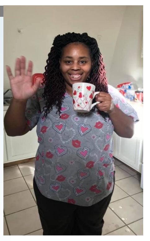
Update on MS from Lady Page 2

While communicating with our Field Directors in Haiti, Peru and Guatemala on continuing programs and giving assistance to the communities we work in, I have learned much about how this virus has affected the lives of those living in extreme poverty in a variety of ways. Even though the number of COVID-19 cases in Haiti is low, the effects of this pandemic are heavy. A large percentage of Haiti's population relies on international support. Many survive off of the income they make selling used clothing and other goods that are sent from the United States. Many have family members living in the US that financially support them year round. (cont'd on pg 3)