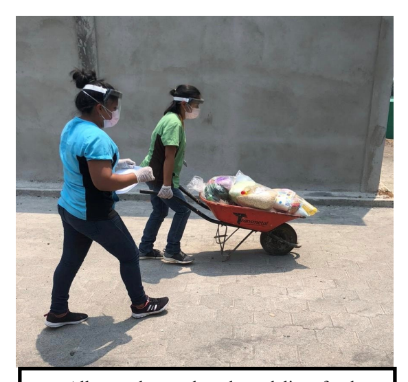
All geared up and ready to deliver food In Ixtacapa, Guatemala

where we will post fun content, Child Sponsorship photos and pictures from our teams.