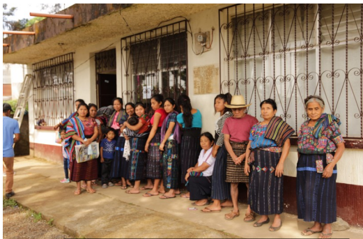
Patients wait outside the clinic in Xocola

Our Guatemala site has been buzzing with both construction and medical teams. Our medical teams have been seeing patients in our Ixtacapa clinic and have been doing clinics at our Xocola sight. The construction teams have been working on houses as well as a new library for the after-school tutoring and higher education students. The library will provide a space for students to do homework and receive after school help, and includes computers, printers, and internet. The leadership group has started again, and the 10-20 participants will complete the 12-week seminar. The cooking classes will also be starting up again in the beginning of February.