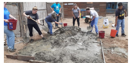
Building a classroom!

Our second team to Peru (this time, from Loras College) returned from Peru mid-January. While there, they built a large soccer field for a local school.