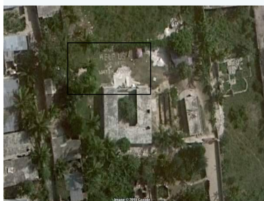
A message spelled out in stones reads: “We need food and water.”

Remembering the earthquake in Haiti 10 years ago today, we remember the anxious days when we could not reach anyone in Haiti and did not know if our staff was safe. We remember the joy of seeing a message via Google Earth (pictured below) saying they were safe followed by the tears twelve days later upon seeing the devastation. We are thankful for all of the individuals who reached out at that time to help by traveling to Haiti to provide medical care by counseling and construction help, by helping on the US side with logistics, and by donating generously.