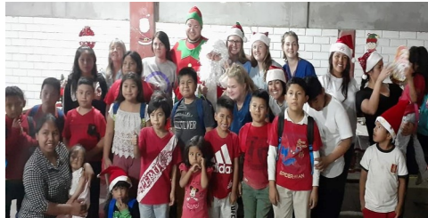
Christmas Party in Peru

The first trip non-assessment team trip happened in December; and we are happy to report, it was a success! The team-built a (desperately needed) extra classroom for a local school in La Ventanilla in Lima, Peru. There are 2000 kids that live in this school's area, but there was only room for 600 students. They previously had to no place to house children, who desperately wanted to learn, but there was physically no room for them. They also had a medical clinic and a Christmas Party!